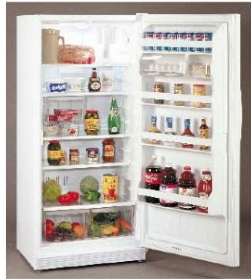
Automatic Defrost All-Refrigerator