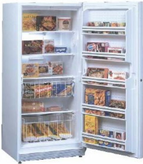
Automatic Defrost Upright Freezer

Consumer Contact: Contact W.C. Wood toll-free at (866) 493-3314 or visit the firm's Website at www.freezer-repair.com .